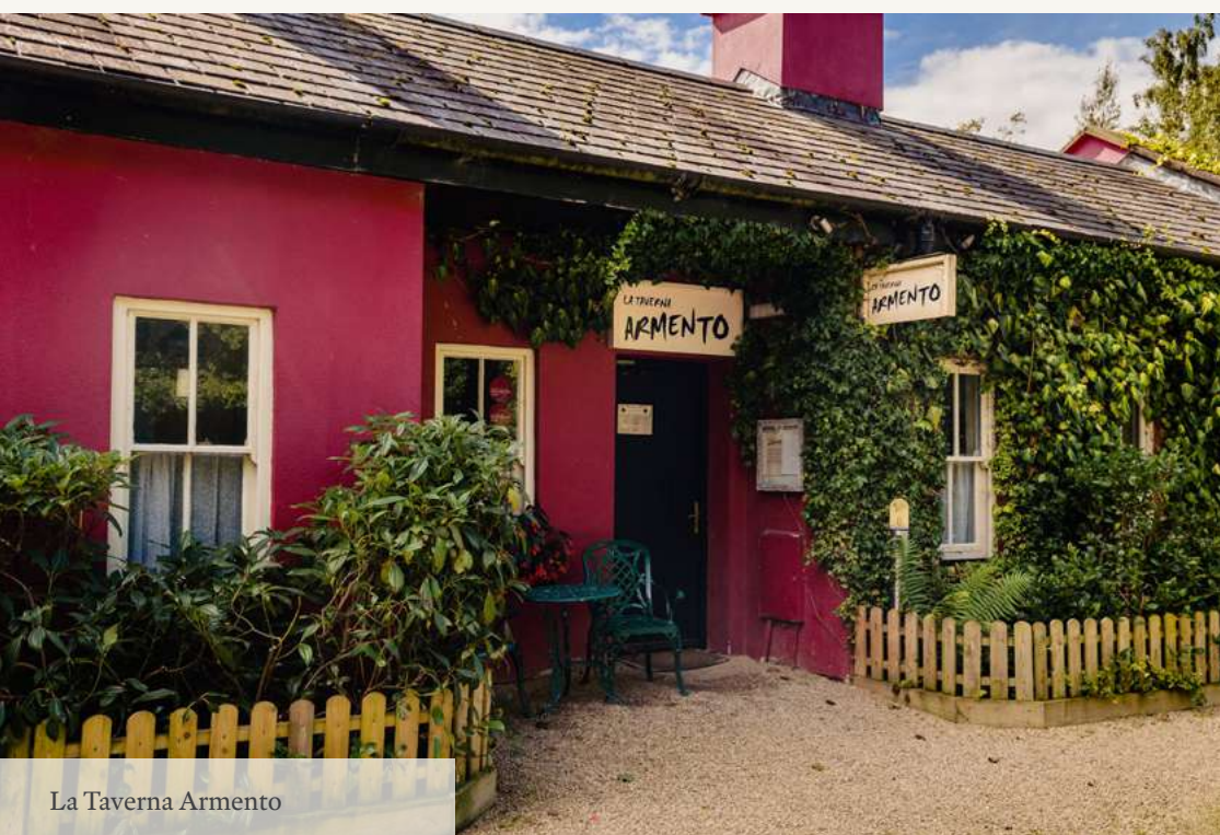
La Taverna Armento