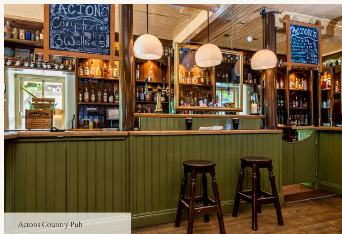
Actons Country Pub

The Strawberry Tree Restaurant was Ireland's first fully organic restaurant. La Taverna Armento serves authentic Italian cuisine and was inspired by the ancient village of Armento in the province of Basilicata.