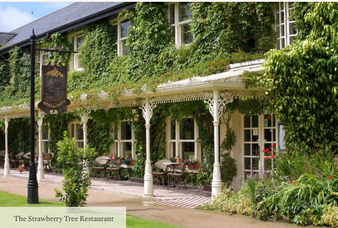
The Strawberry Tree Restaurant