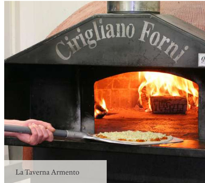
La Taverna Armento

The village also contains La Taverna Armento a popular Italian restaurant, and the unique Macreddin Chapel, which is perfect for weddings and special events.