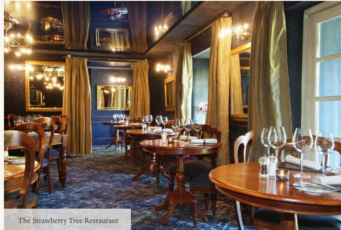
The Strawberry Tree Restaurant